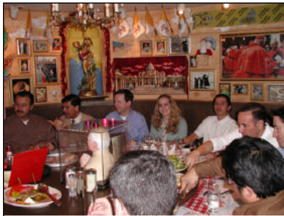
Young adult leaders from the Hispanic Youth and Young Adult community, Our Lady of Angels, Stanford Circle, St. Agnes, St. Vincent de Paul, St. Dominic and Notre Dame des Victories at Buca de Beppo Restaurant.

If you would like to participate in the Parish Visitation Program and/or Young Adult Leaders' Forum , please contact us.