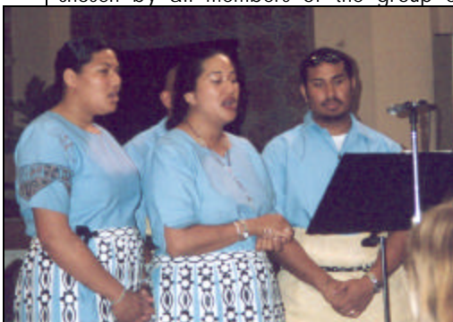
Photos are of Lataki members during liturgy at Assisi, Italy for 2000 World Youth Day. St. Timothy sent eight members to WYD with the Archdiocesan pilgrimage.

The continued success of the San Mateo Lataki depends on the commitment and participation of our members and most importantly from the help and guidance of our Lord. We feel truly blessed to have been given such a variety of talents to work with in our young adult community. We hope to continue to grow physically, spiritually and emotionally with the Holy Spirit in our endeavors to build a stronger community for Tongan Catholic young adults.